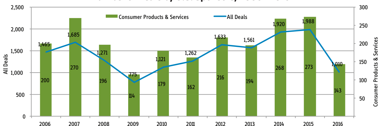
Number of Deals by U.S. Sponsors, 2006 - 2016

There were 15,691 transactions worldwide by U.S.-based buyout firms with a total disclosed valuation of about $2.0 trillion from January 1, 2006 through August 10, 2016. From this tally, 2,215 transactions took place within the Consumer Products & Services industry and those with reported financial details combined for about $135 billion.