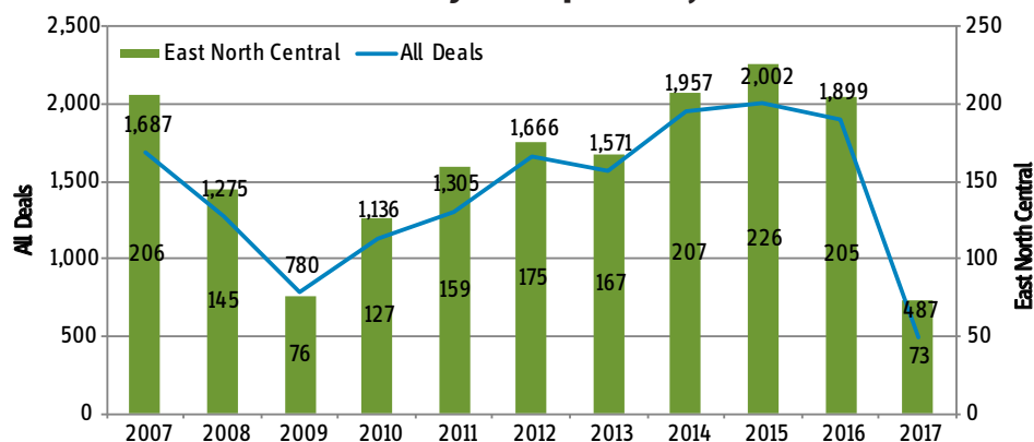
Number of Deals by U.S. Sponsors, 2007 - 2017

There were 15,765 transactions worldwide by U.S.-based buyout firms with a total disclosed valuation of about $1.8 trillion from January 1, 2007 through April 4, 2017. From this tally, the East North Central states were responsible for 1,766 transactions and those with reported financial details combined for about $188.2 billion.