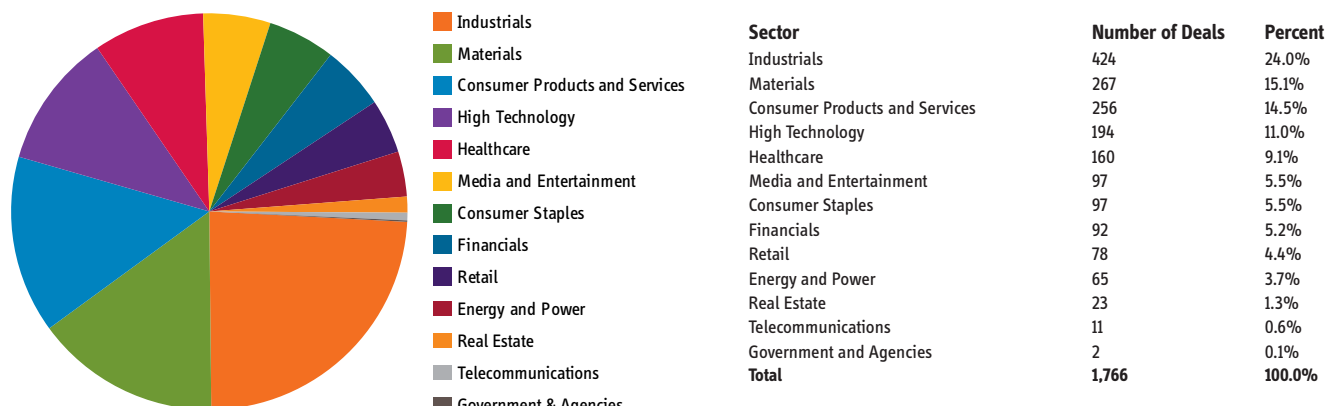
LBO Deals in East North Central(2007 - 2017)

Within the deals made in the East North Central states by U.S. LBO firms, High Technology led the way with 136 of the 707 transactions (19.2 percent) from 2007 to 2017. Placing second was Consumer Products and Services, accounting for 117 deals (16.5 percent), while Industrials came in third with 111 deals (15.7 percent).