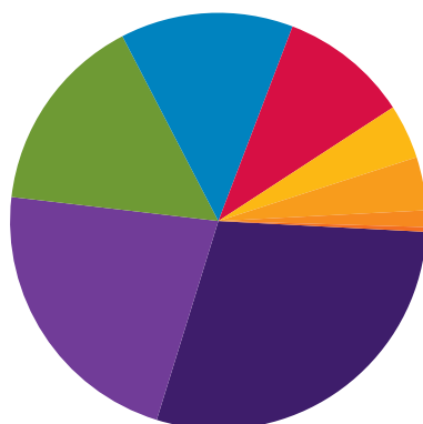
LBO Deals in Media & Entertainment (2007 - 2017)

Within Media & Entertainment, Advertising & Marketing was the leading sector, accounting for 315 of the 1,088 transactions (29 percent) from 2007 to 2017. Placing second was Publishing with 240 deals (22.1 percent), while Hotels and Lodging came in third with 169 deals (15.5 percent).