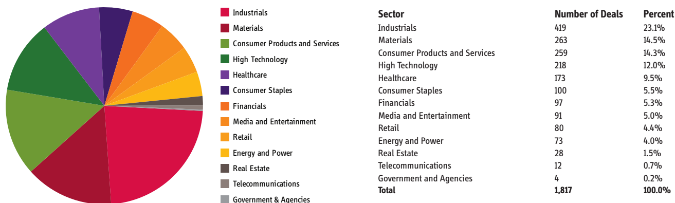
LBO Deals in the East North Central (2008 - 2018)

Within the deals made in the East North Central states by U.S. LBO firms, Industrials led the way with 419 of the 1,817 transactions (23.1 percent) from 2008 to 2018. Materials placed second, accounting for 263 deals (14.5 percent), while Consumer Products and Services came in a close third with 259 deals (14.3 percent).